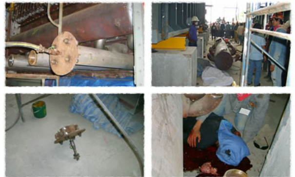
FIGURE On one hand it is very sad to hear that someone loss his life ,but on the other hand, put our hands on our heart and ask have we all done enough to avoid some one to be killed?